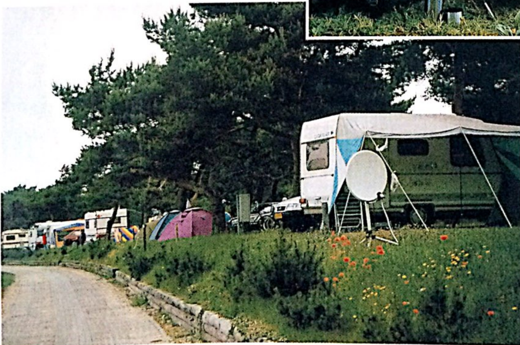
Auf einem Campingplatz ist immer viel los.