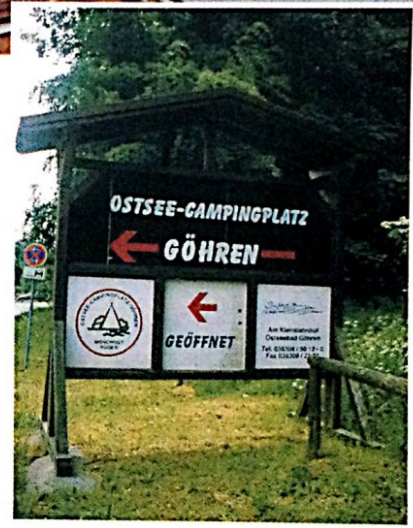
Wo ist dieser Campingplatz?